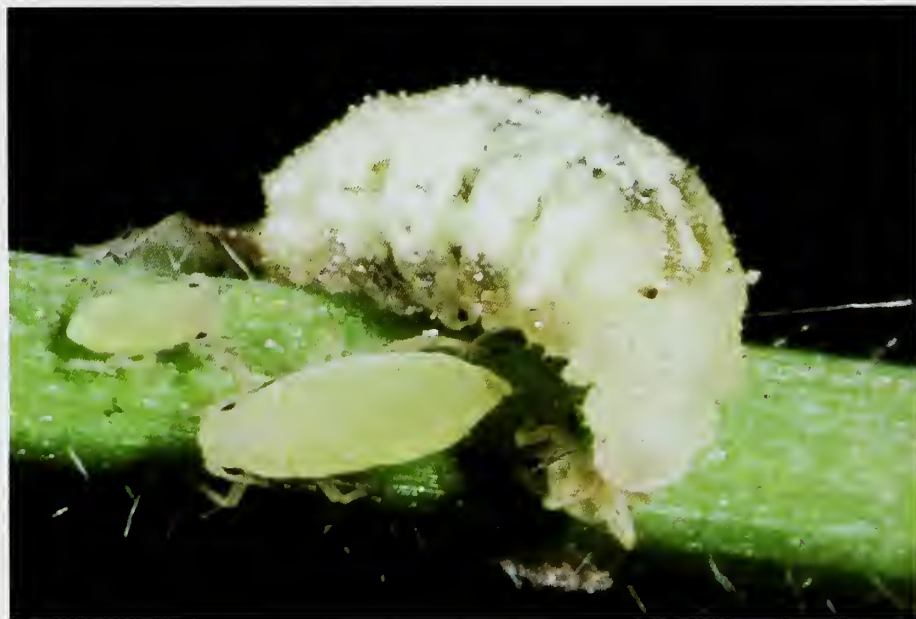
The larva of a predaceous fly ( Leucopis sp.) feeding on Russian wheat aphid.